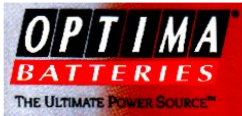
Optima "Spiral" Sealed Lead Acid Battery Specifications and Prices: